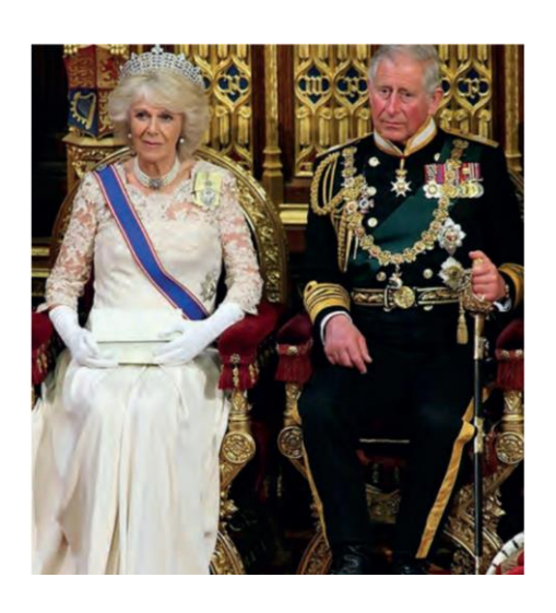
2nd June Reception at Schloss Richmond