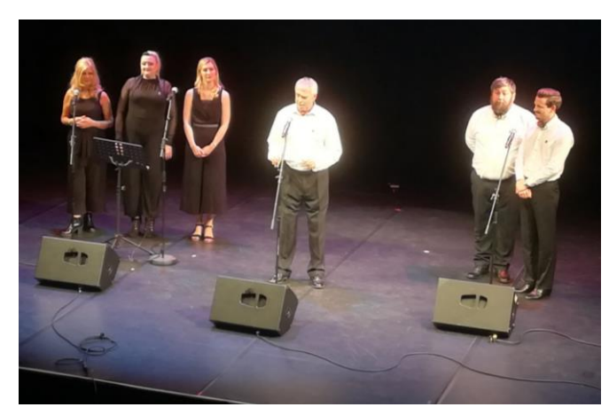
BODS at the Kulturnacht

Kulturnacht in Braunschweig. The Bath Operatic & Dramatic Society (BODS) and the ukulele band, Uke Can't be Serious from Bath are participating.