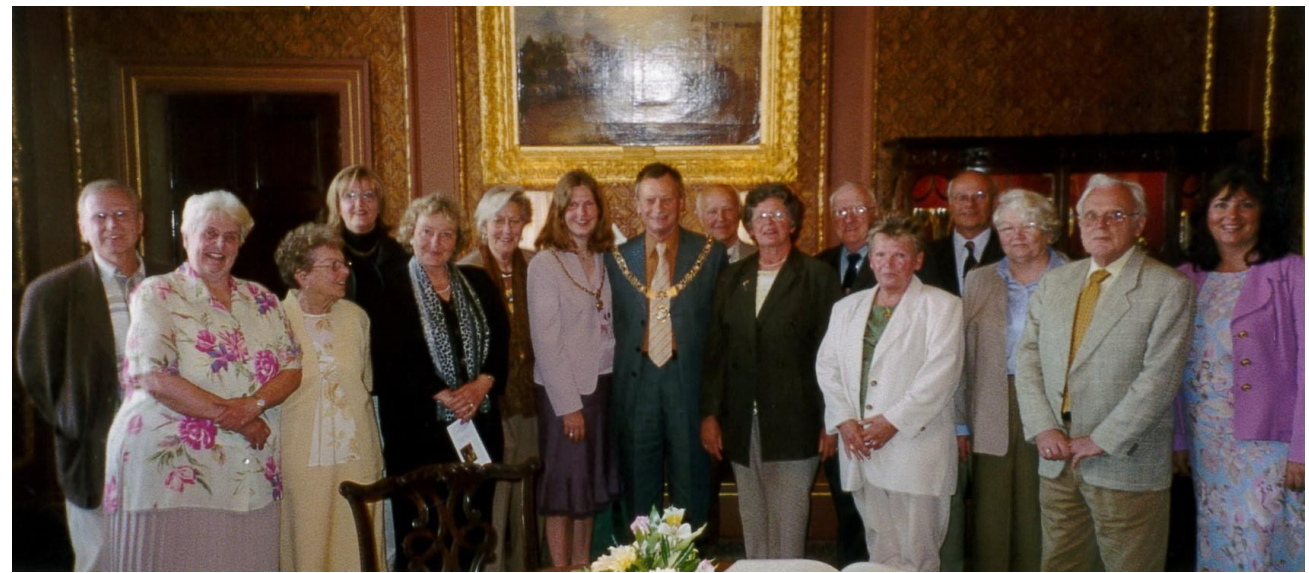
in the mayor's parlour

Eleven members of the DEG e.V. travelled to Bath and London.