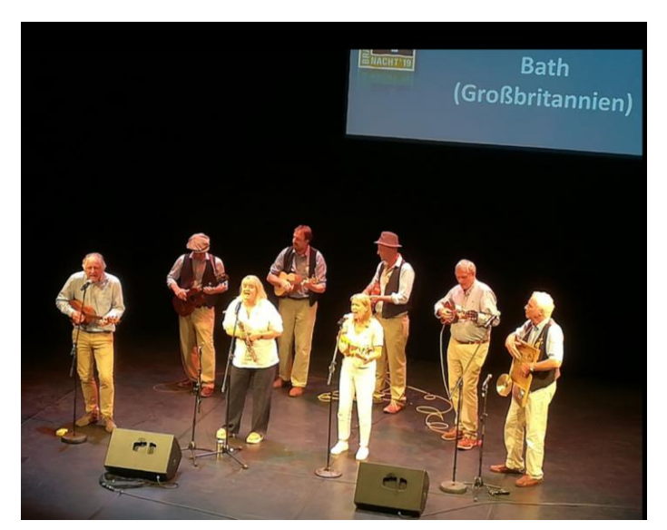
Uke can't be serious at the Kulturnacht