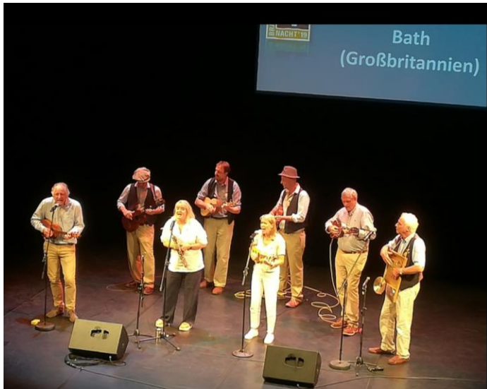
Uke can't be serious at the Kulturnacht