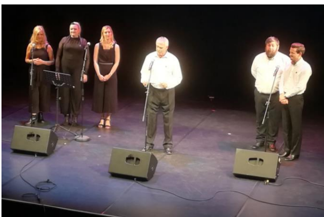
BODS at the Kulturnacht

Kulturnacht in Braunschweig. The Bath Operatic & Dramatic Society (BODS) and the ukulele band, Uke Can't be Serious from Bath are participating.