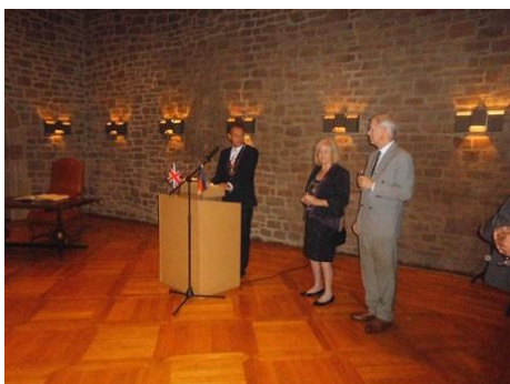
Mayor of Bath Cherry Beath, her husband Richard and Braunschweig's Lord Mayor Ulrich Markurth

The DEG e.V. welcomed a delegation of Bath in order to commemorate the 70 th anniversary of the end of WWII.