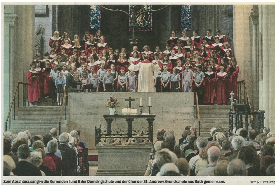
Zum Abschluss sangen die Kurrenden I und II der Domsingschule und der Chor der St. Andrews Grundschule aus Bath gemeinsam.